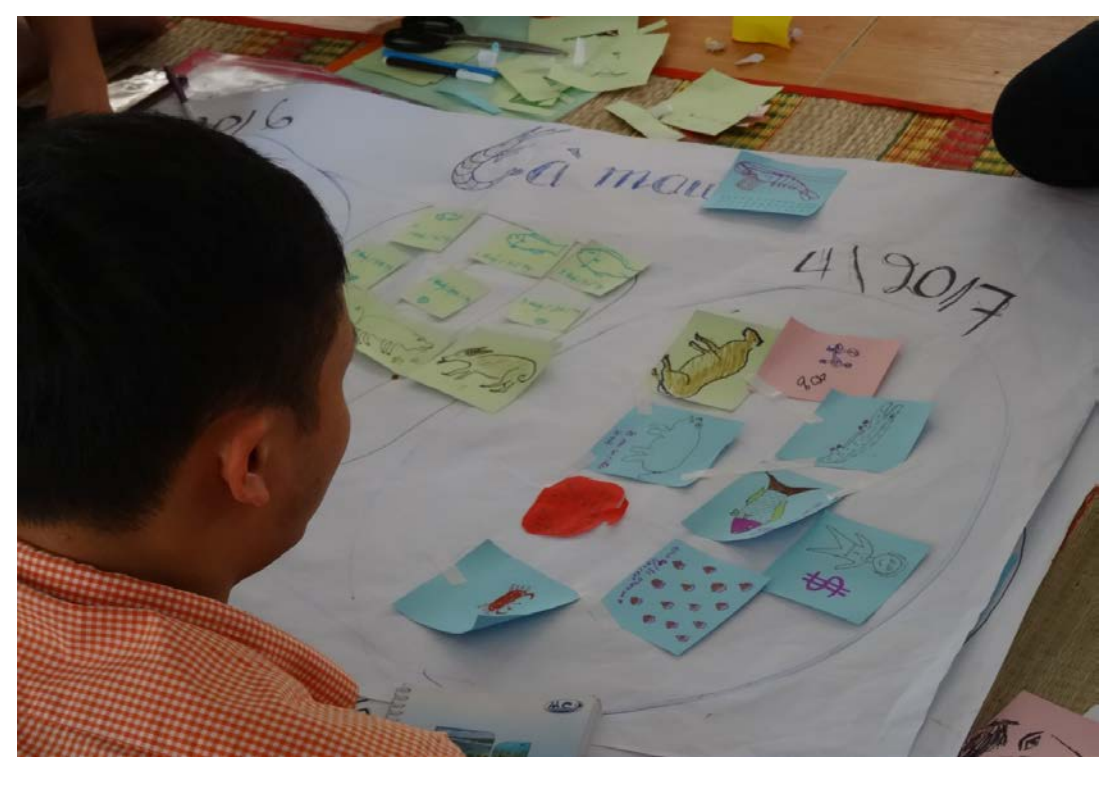
Figure 2: representatives from shrimp farmers in Ca Mau, Vietnam, developing their vision for gender relations and improved livelihoods (Reemer, 2016)