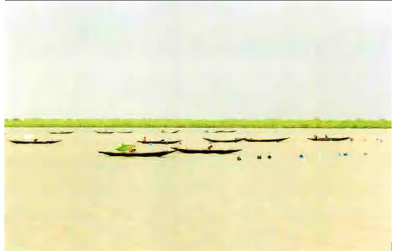
In the river (North)