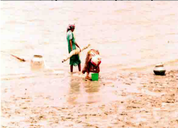
In the creeks (South)