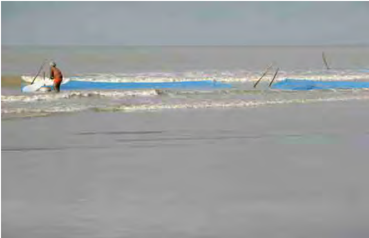
Along the coast (South)